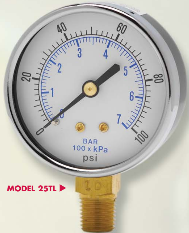
MODEL 25TL ▶